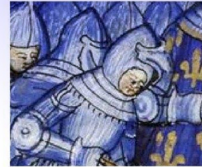
France, circa 1390