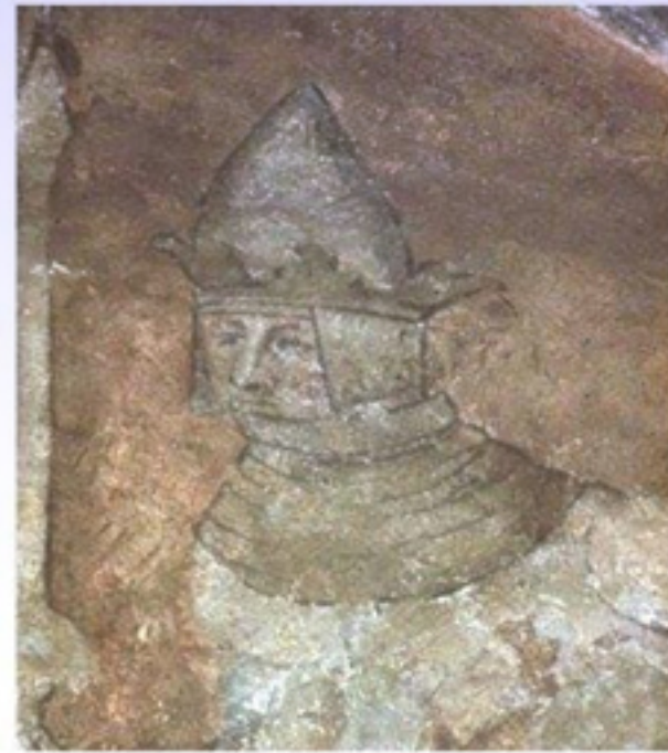
Russia, circa 1390