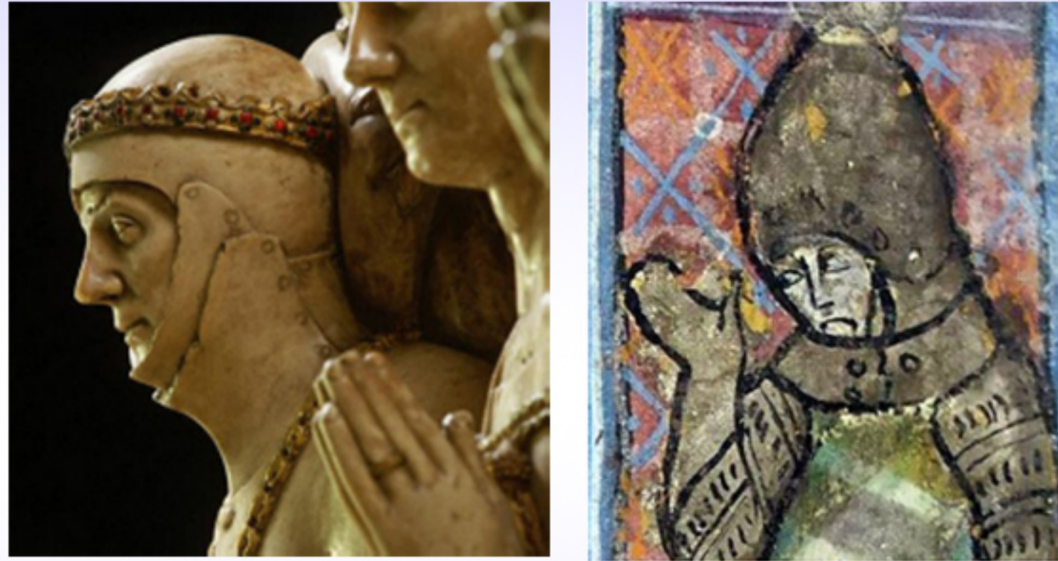
Plate armor element worn around the neck to protect the throat, back of the neck and clavicles.