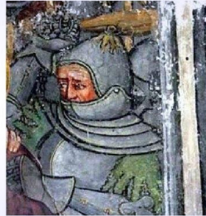
Italy, circa 1410