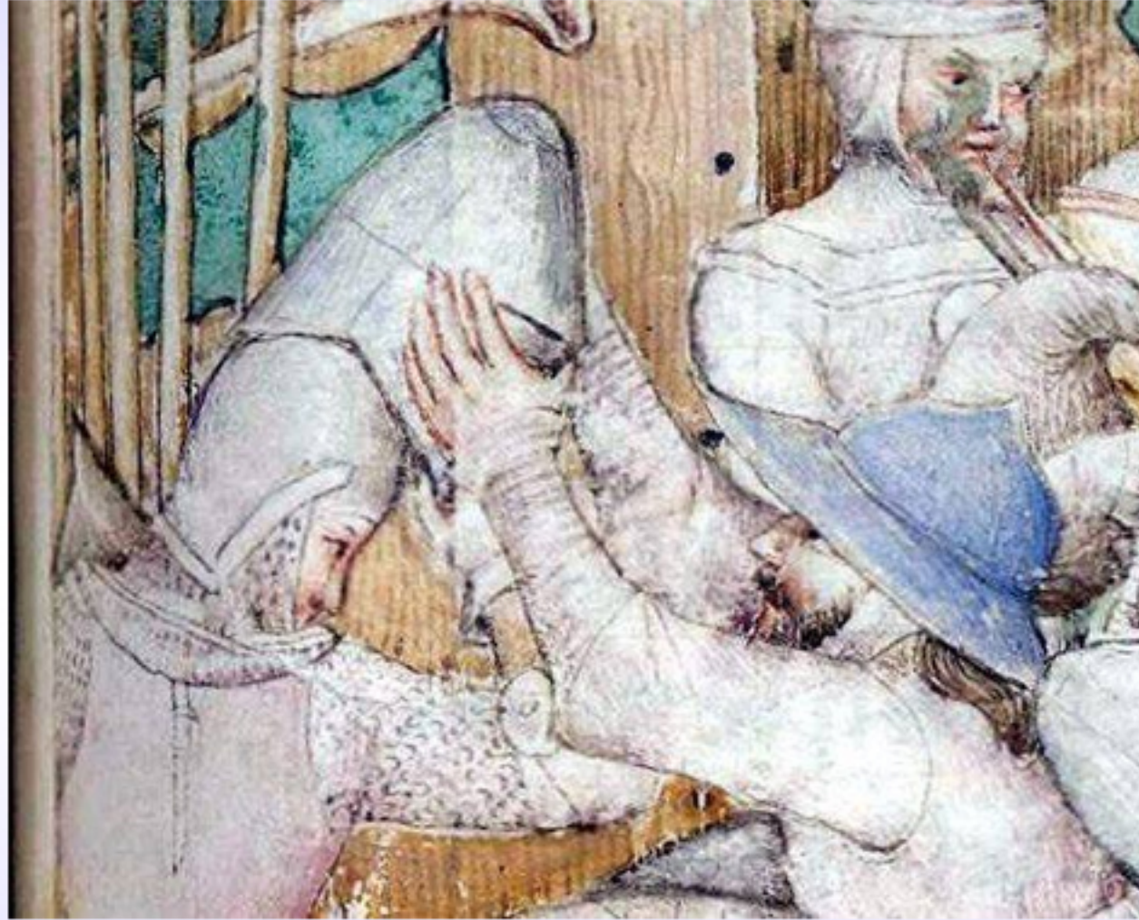
Gorget: Chainmail or Scale